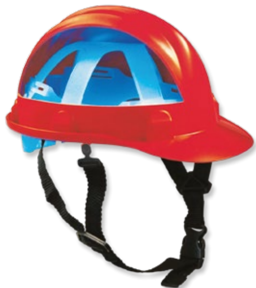
Figure B: Harness (inside the shell)