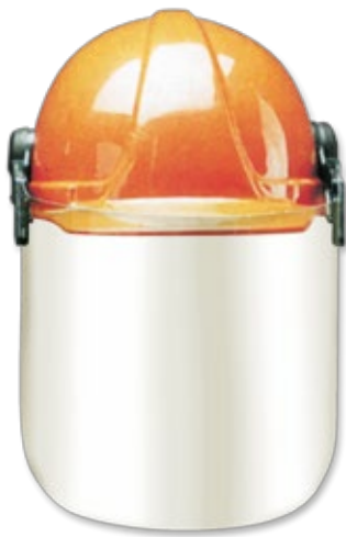
Figure D: Faceshield

There is a wide range of accessories which can be fitted to a safety helmet to make it more suitable for variable working conditions. Examples of accessories are faceshield, earmuffs, and headlamp (Figures D to F). Care should be taken to ensure that any addition of helmet accessories and their attachment should be compatible to the helmet. Use of original manufacturer's accessories is recommended. No modification or change of existing helmets should be carried out to fit accessories unless advice from the manufacturer has been sought.