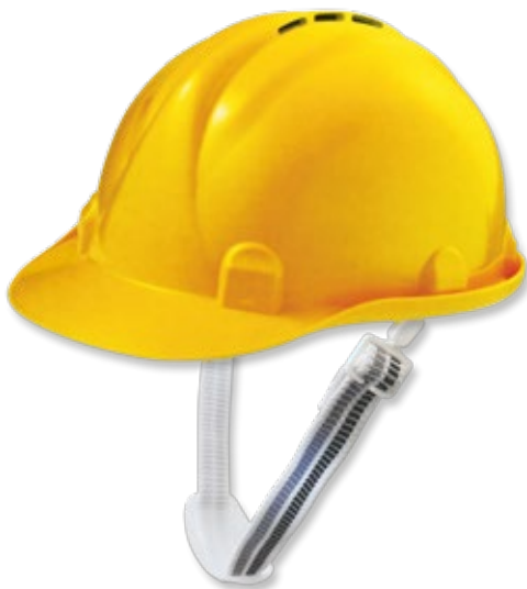
Figure A: Shell

A safety helmet consists of three primary components - (I) shell, (II) harness and (III) chin strap (Figures A & B).