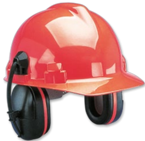
Figure E: Earmuffs