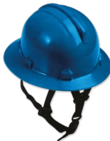
Figure H: The Hat Style