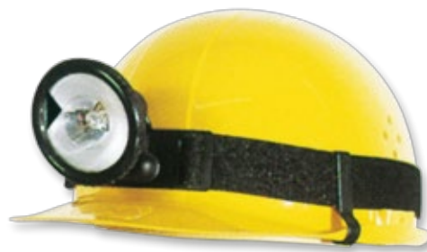
Figure F: Headlamp

(Chin straps are deliberately omitted on the safety helmets for clear demonstration of accessories.)