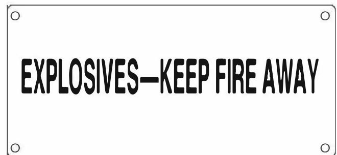
FIGURE 5.4.2.4 Warning Statement on Type 2 Indoor Magazines.