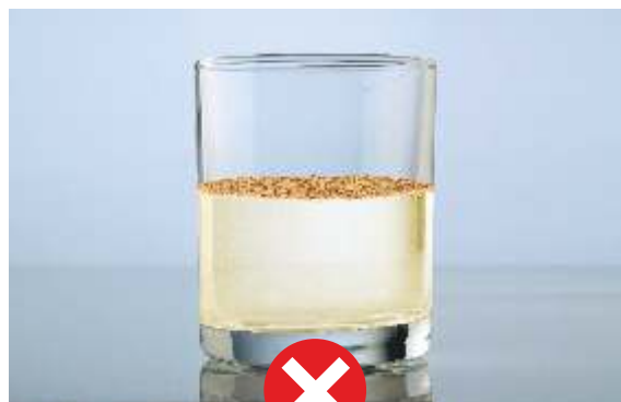
Excess bran in wheat flour