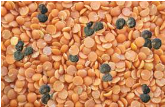
Datura seeds in food grains