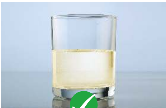
Pure wheat flour